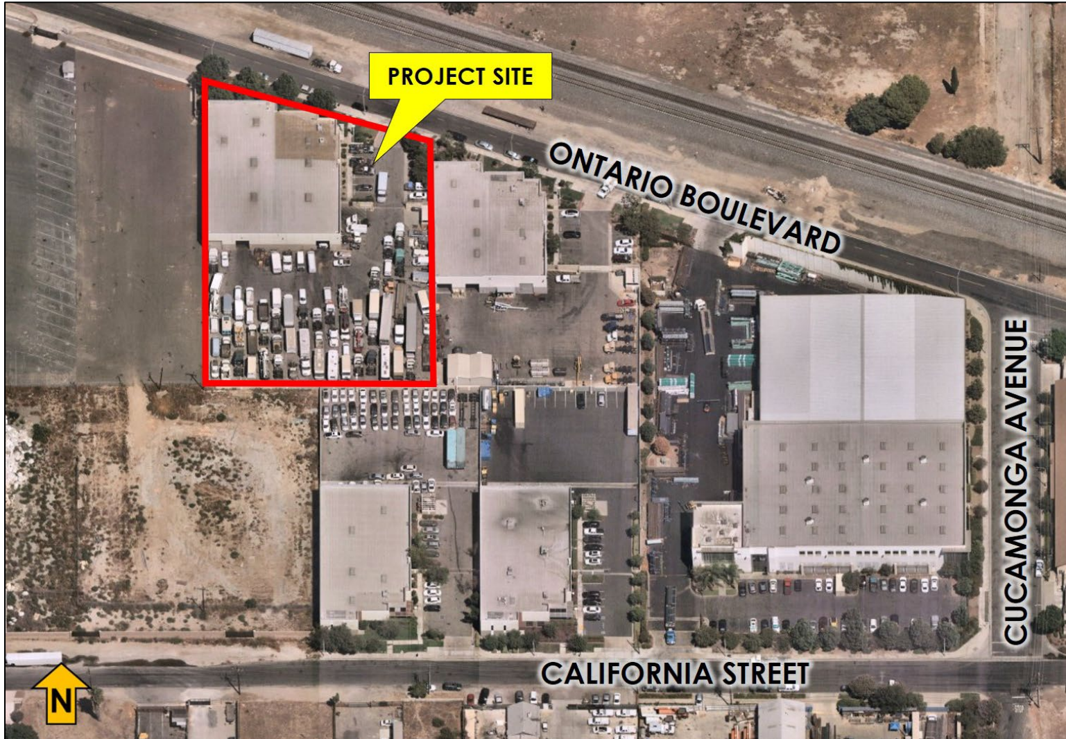
Exhibit A: PROJECT LOCATION MAP